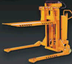
Mobile Leveler / Stacker