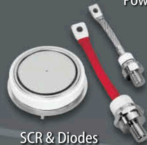
SCR & Diodes