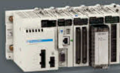
PLCs Control Systems