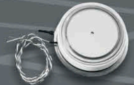
GTO & Thyristors