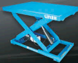
Stationary Lift Table