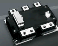
IPM & Mosfet