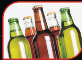
Glass & Blowing