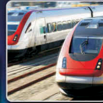
Mass Transportation & Locomotive