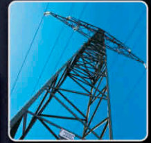
Energy Transmission & Distribution T&D