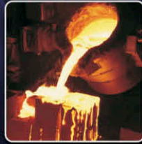
Metallurgy & Foundries